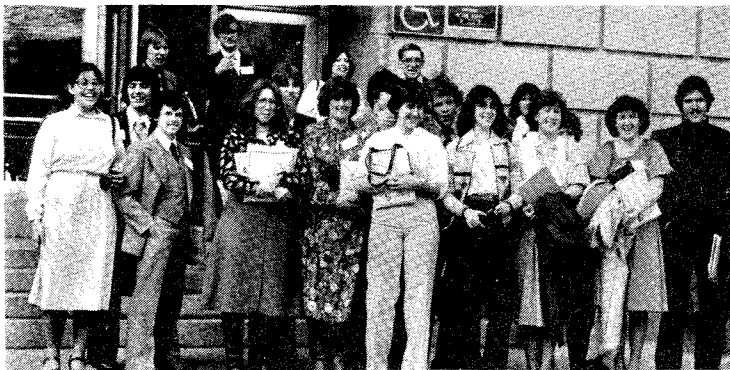
Delegates see Department of Law Enforcement