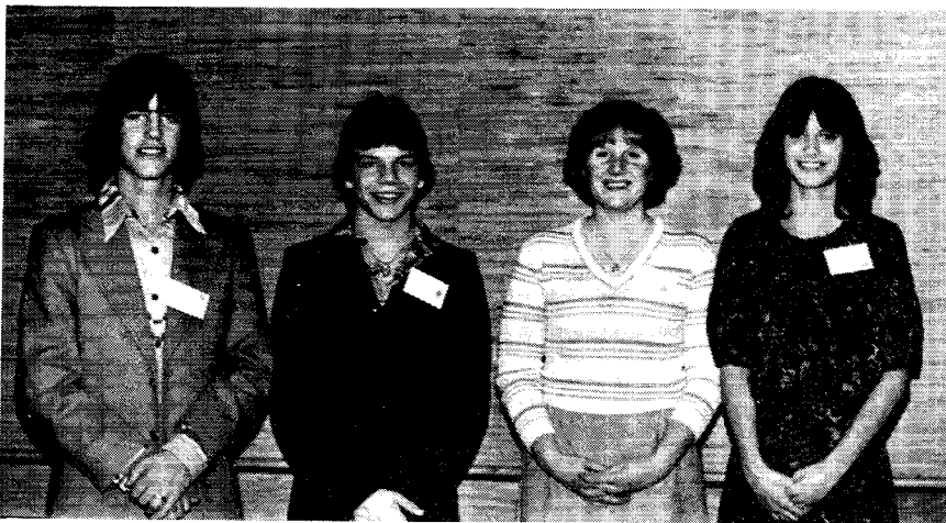
Kickapoo District Officers